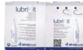
-LUBRIKIT- single-dose lubricant for housing o-ring CODE RE9020650