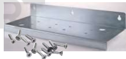
-T- wall bracket CODE RB7401010