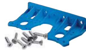
-D- wall bracket CODE RB7400009