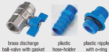
brass discharge ball-valve with gasket